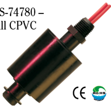
LS-74780 – All CPVC

Particularly well suited for rough service. Ideal for use in chemical and plating applications.