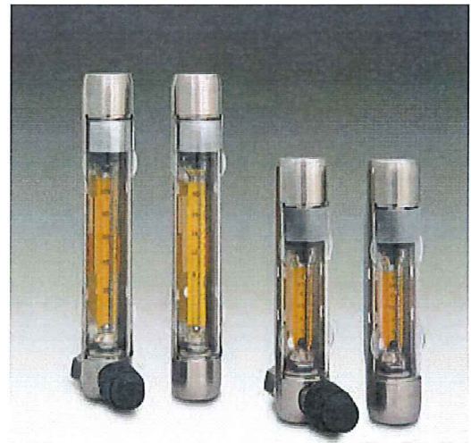
Glass Tube Purge Meters with Stainless Steel Frame