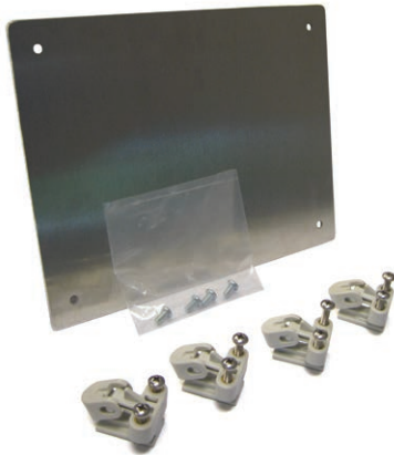
Includes mounts, screws and panel.