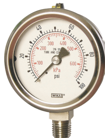
Bourdon Tube Pressure Gauge Model 232.53 - 2½"

Ambient: -40°F to +140°F (-40°C to +60°C) - dry -4°F to +140°F (-20°C to +60°C) - glycerine filled -40°F to +140°F (-40°C to +60°C) - silicone filled Medium: +212°F (+100°C) maximum