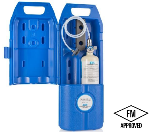
Model 1250-01 Calibration Kit Type A

The 1250-XX Calibration Kit is used to deliver calibration gas for combustible gases and a wide variety of toxic gas detection modules including Carbon Monoxide, Hydrogen, Combustible Gas, Hydrogen Sulfide, Chlorine, Sulfur Dioxide, Nitric Oxide, Nitrogen Dioxide and Zero Grade Air. Other gases are available, contact Sierra Monitor for the latest information. There are three versions of the calibration kit available depending upon the specific calibration gas required. Each kit contains a regulator, calibration adapter and carrying case. The individual calibration gas cylinders (Series 1260) are sold separately.