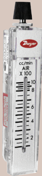
Model RMA-TMV 2" scale, 4-13/16" high