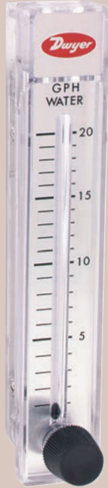
Model RMB-SSV 5" scale, 8-3/4" high