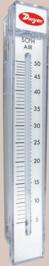
Model RMC 10" scale, 15-3/8" high