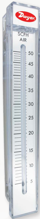
Model RMC 10" scale, 15-3/8" high