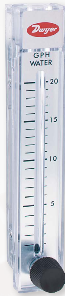
Model RMB-SSV 5" scale, 8-3/4" high