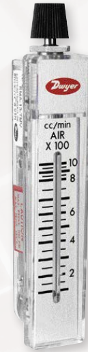
Model RMA-TMV 2" scale, 4-13/16" high