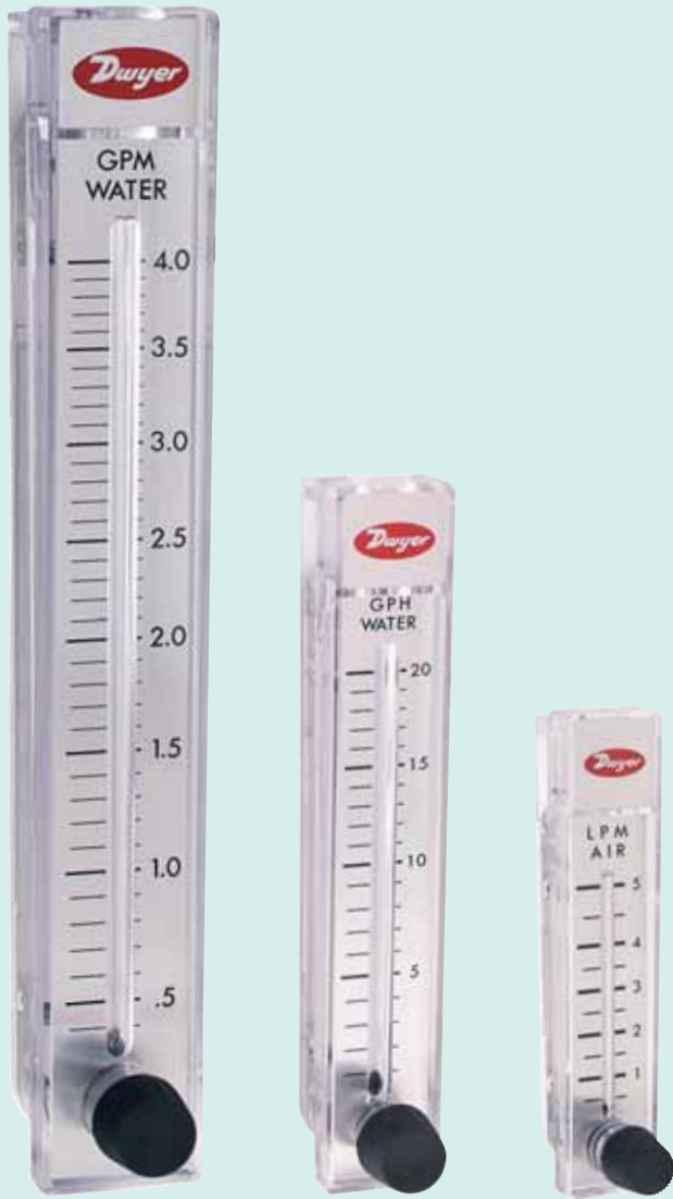
Model RMC-SSV 10" scale, 15-3/8" high