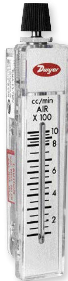
Model RMA-TMV 2" scale, 4-13/16" high