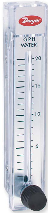
Model RMB-SSV 5" scale, 8-3/4" high