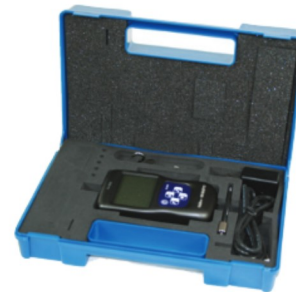
FG-3000 with Accessories in Protective Carrying Case