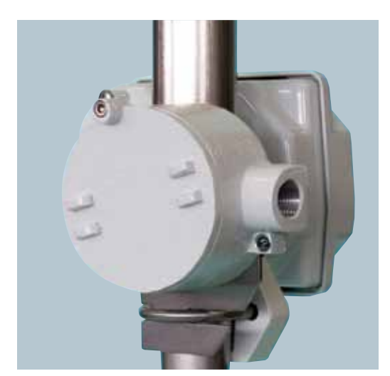
Electronic Flow Transmitter mounted on meter body

Dimensions – For complete dimensions, please refer to literature: WT.550.200.106.UA.CN.