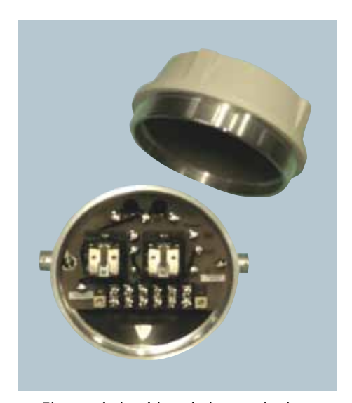
Flow switch with switches and relays

Dimensions – For complete dimensions, please refer to literature: WT.550.200.104.UA.CN.