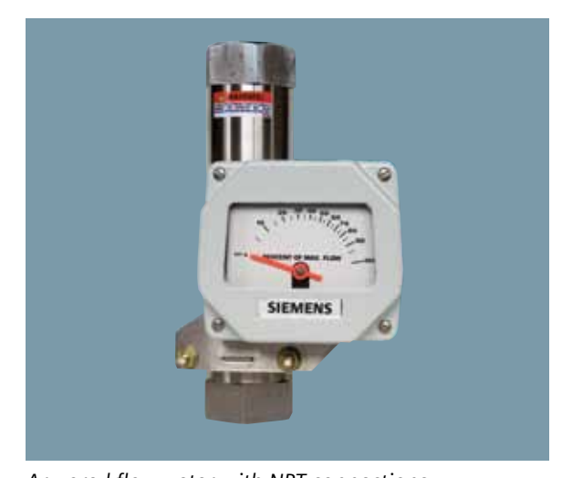
Armored flowmeter with NPT connections

The standard readout is in a magnetically coupled indicator unit. Optional 4-20 mA transmitter and alarm switches are also available.