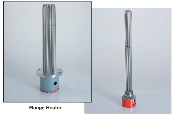
Screw Plug Heater